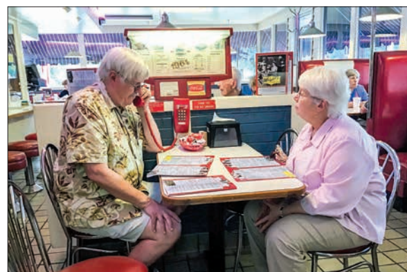
Wright's Dairy Rite - Staunton, Virginia