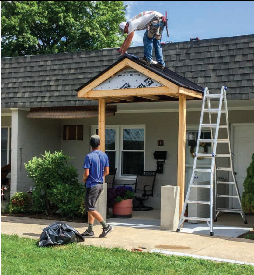
The Courts, the first Village apartments, were built in 1965-68. They are getting a whole new exterior with a modern look and feel that is similar to other Village homes with covered porches, stone columns and new roof faces.