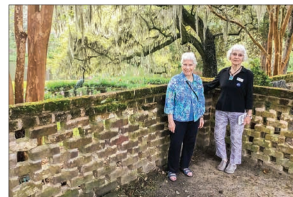
Middleton Place - Dorchester County, South Carolina