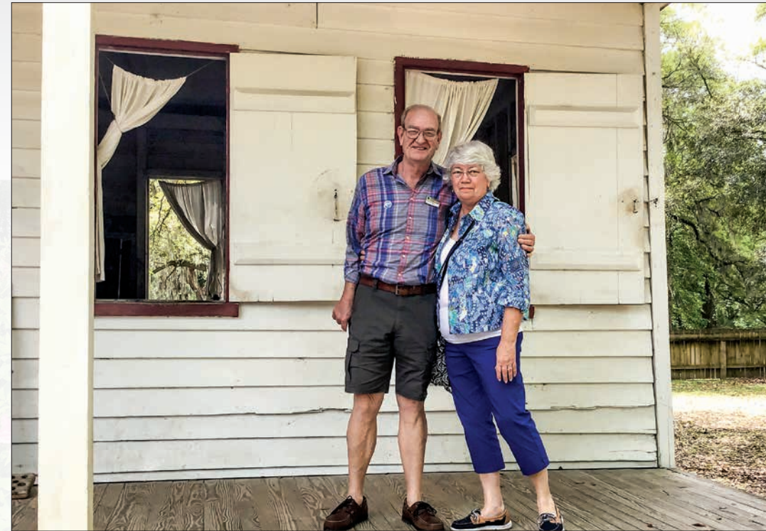
Middleton Plantation - Charleston, South Carolina