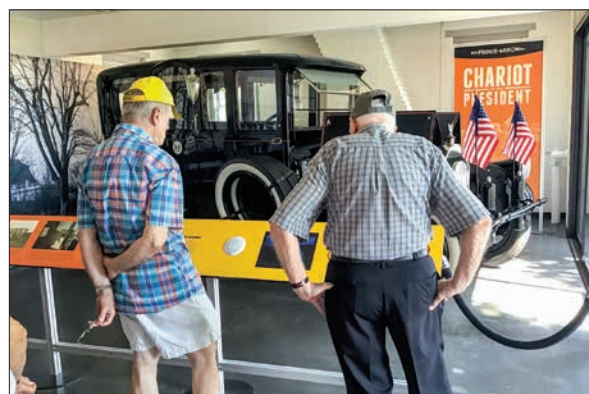
Woodrow Wilson Presidential Library