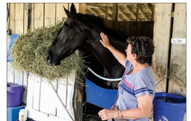
Ellis Park Race Track - Henderson, Kentucky