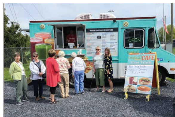
Tropical Smoothy Cafe