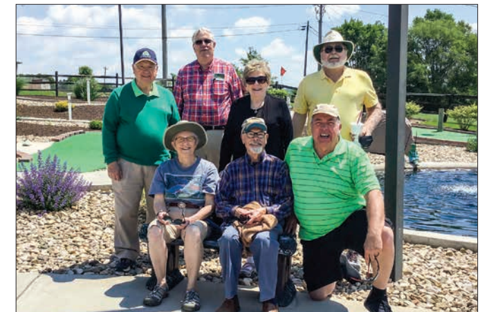
ABOVE: Mulligan's Mini-Golf - Harrisonburg, Virginia