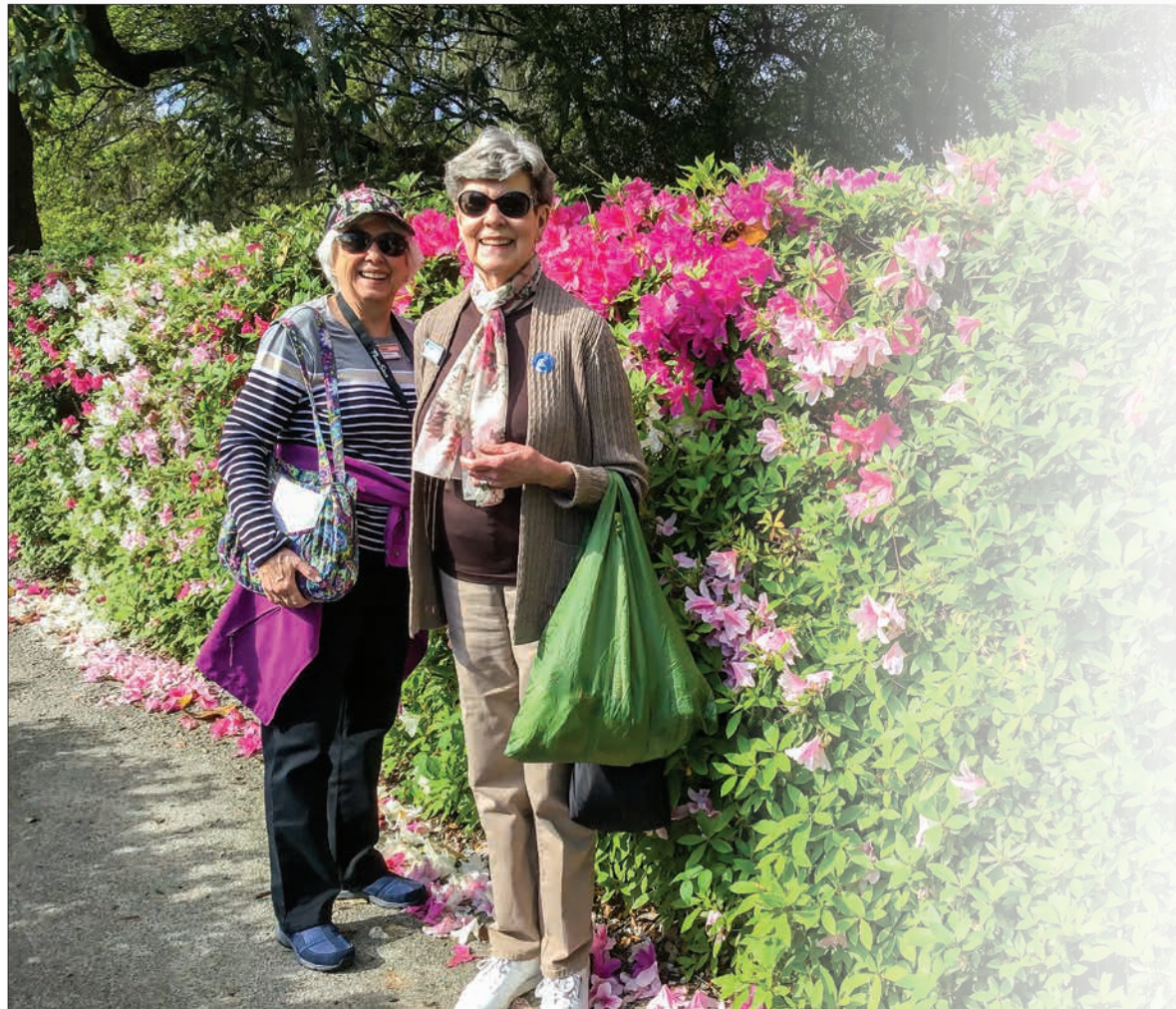
Middleton Plantation - Charleston, South Carolina

Whether it's boarding a bus or a boat, visiting a city, exploring a museum, listening to a concert, playing on a golf course, or just enjoying local treats, our residents enjoy a full range of activities planned by our Activities professionals. Recently trips to Charleston, South Carolina; Paducah, Kentucky; St. Louis, Missouri and Winchester, Virginia were additions to the trips in our local area. Residents have enjoyed old cities, museums, beautiful gardens and a wide variety of eating experiences in interesting places. A huge thank you to the travel teams who plan and lead these tours and to our team members who accompany these trips and make travel easier and safer.